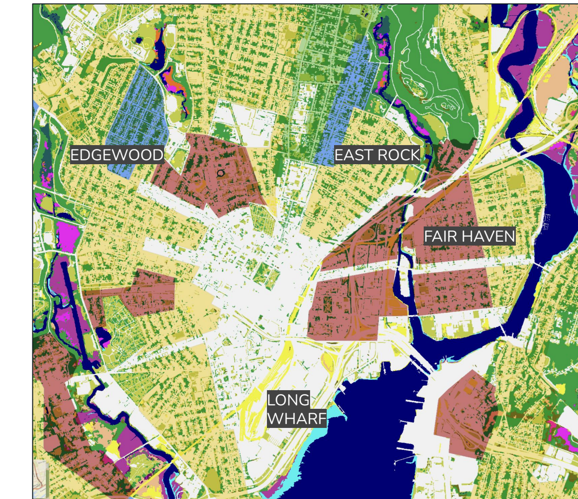
New Haven Land Cover and Redlining Grades