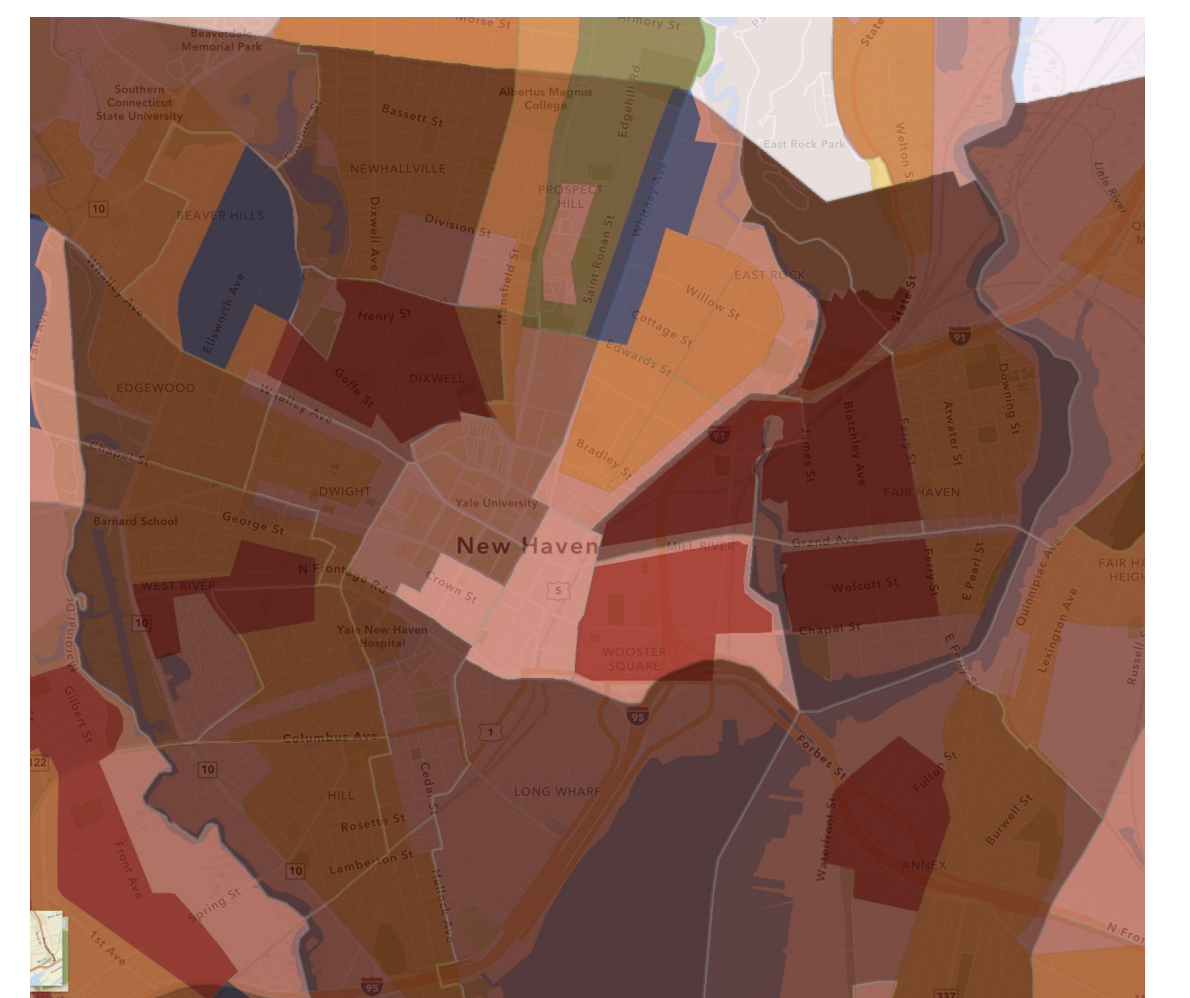
New Haven Redlining Grades and Health Sensitivity