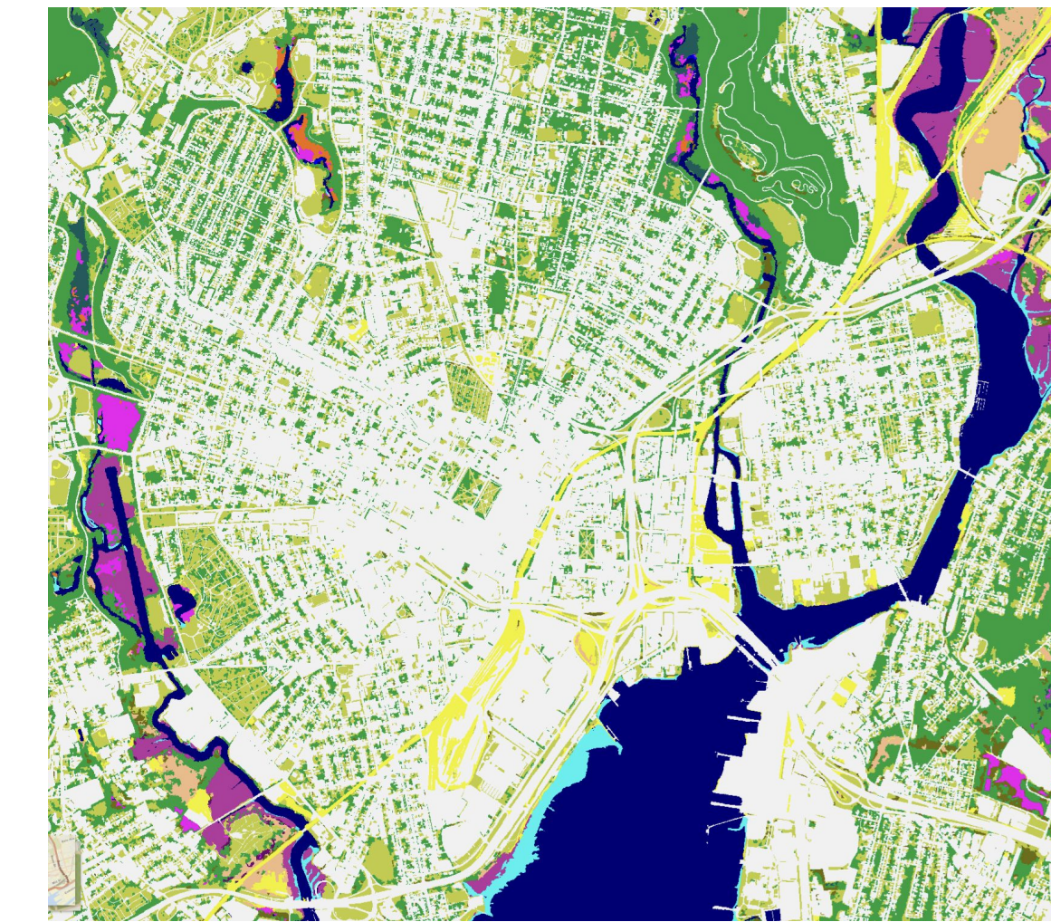
New Haven Land Cover