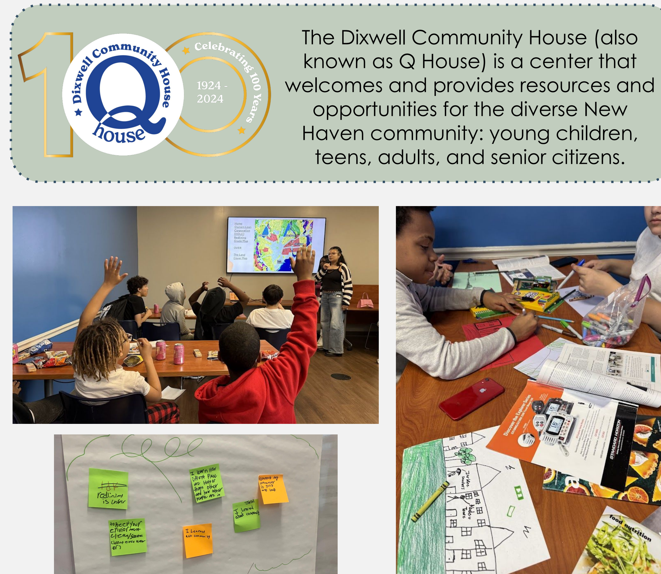
Fig 2. Participating middle school children creating their dream neighborhoods and reflecting on what they learned.