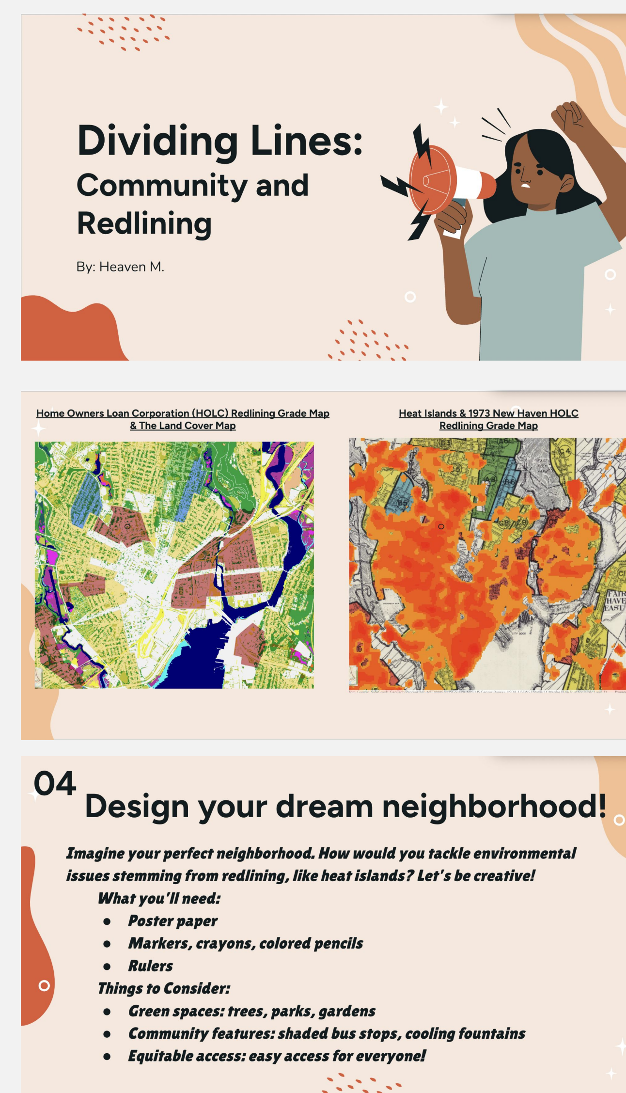
Fig 1. Screenshot of three workshop slides as examples of content covered.